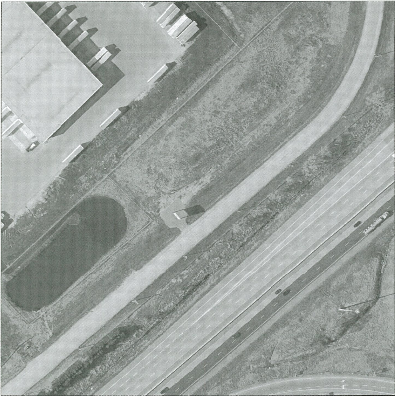
Blown up image. existing sign location.